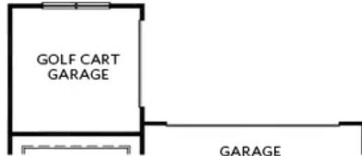
OPT Golf Cart Garage