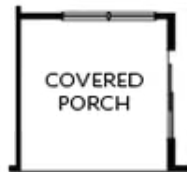
OPT Sliding Glass Door