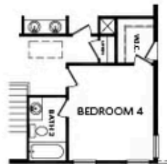
OPT Bedroom 4 w/ Full Bath 3