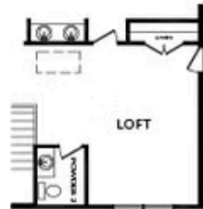
OPT 2nd Powder Room