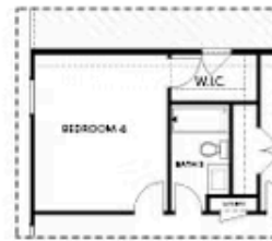
OPT BDR 4 ilo Loft