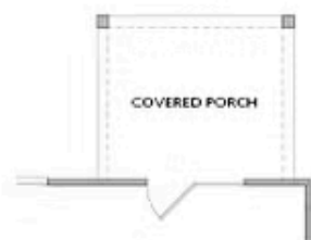
OPT Covered Porch