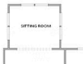
OPT Sitting Room off Rear of Owner's Suite