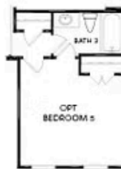
OPT Bedroom 5 w/ Bath 3 into Dining Room & Powder Room