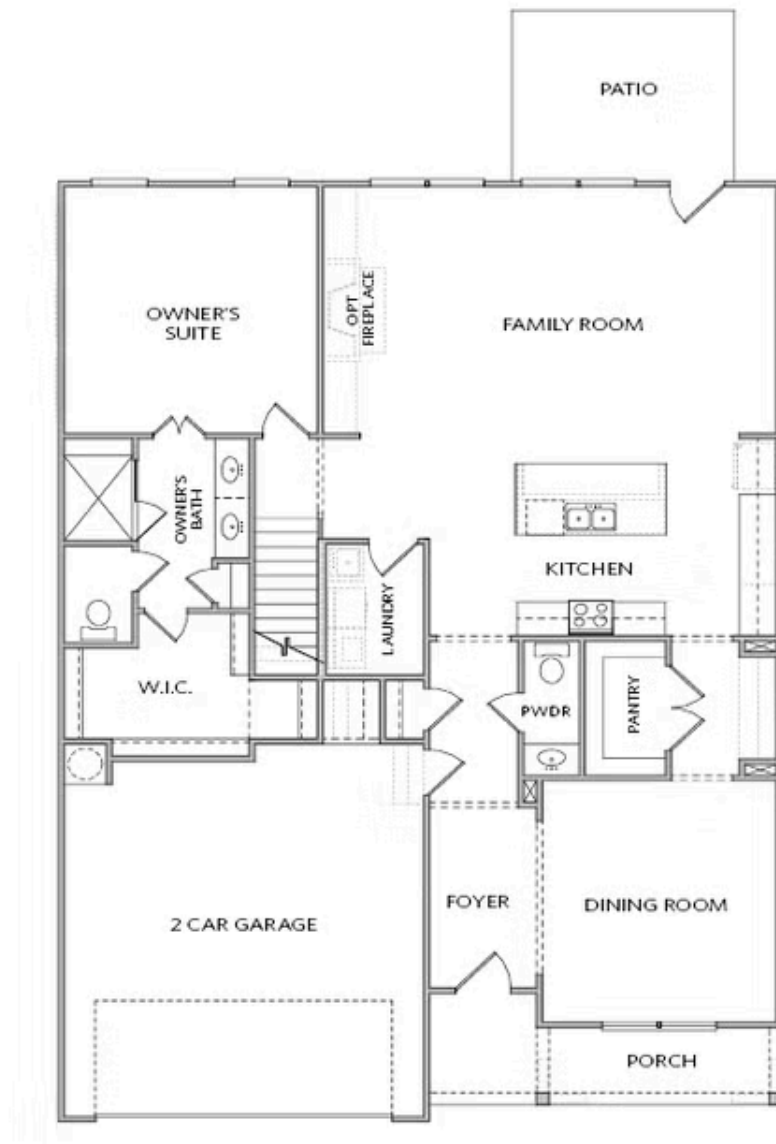
Elevation A, B, C