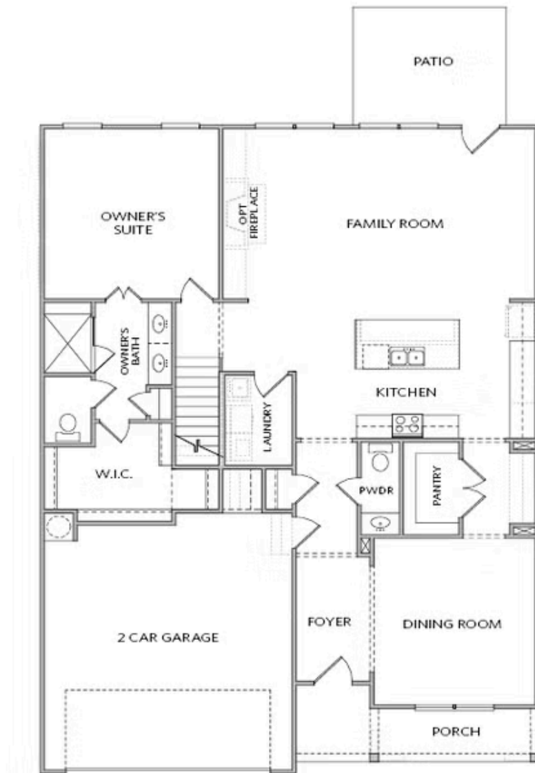
Elevation A, B, C