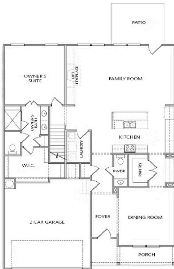
Elevation A, B, C