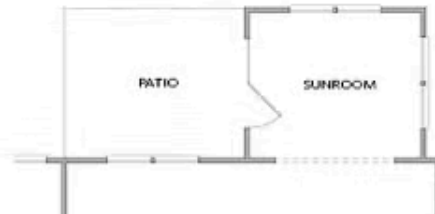
OPT Sunroom Includes Side Patio