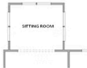
OPT Sitting Room off Rear of Owner's Suite