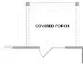
OPT Covered Porch