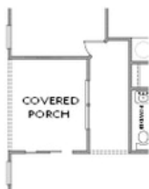
OPT Sliding Glass Door