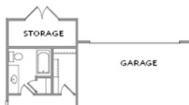
OPT Storage Unit