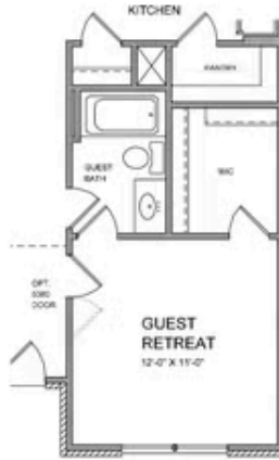
Opt. Guest Retreat