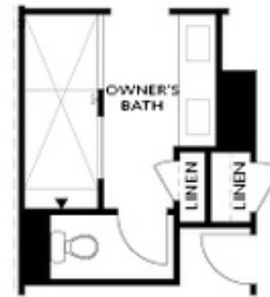
OPT Owner's Walk-Through Shower