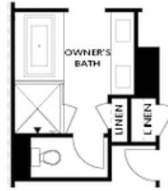
OPT Owner's Shower & Tub Combo