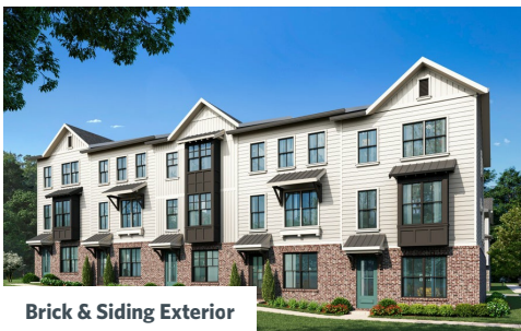
Brick & Siding Exterior