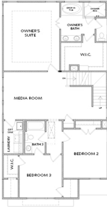
When 3rd Floor is Selected