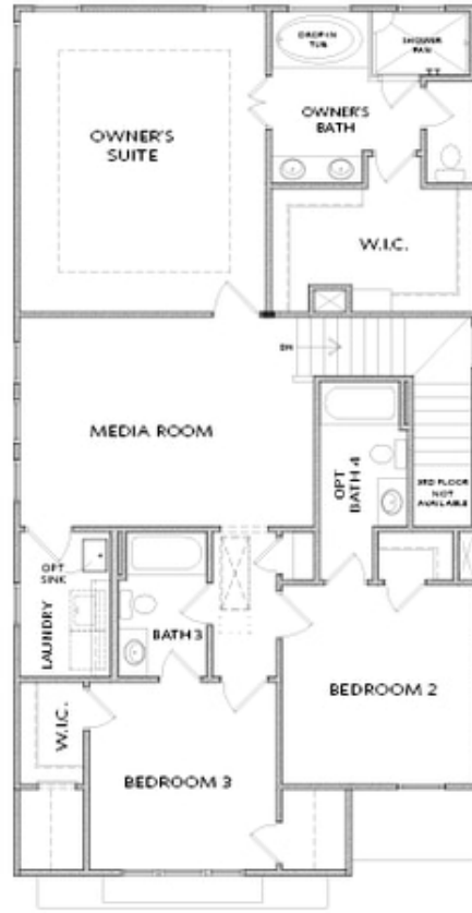
OPT Bath 4 - NO 3rd Floor Available