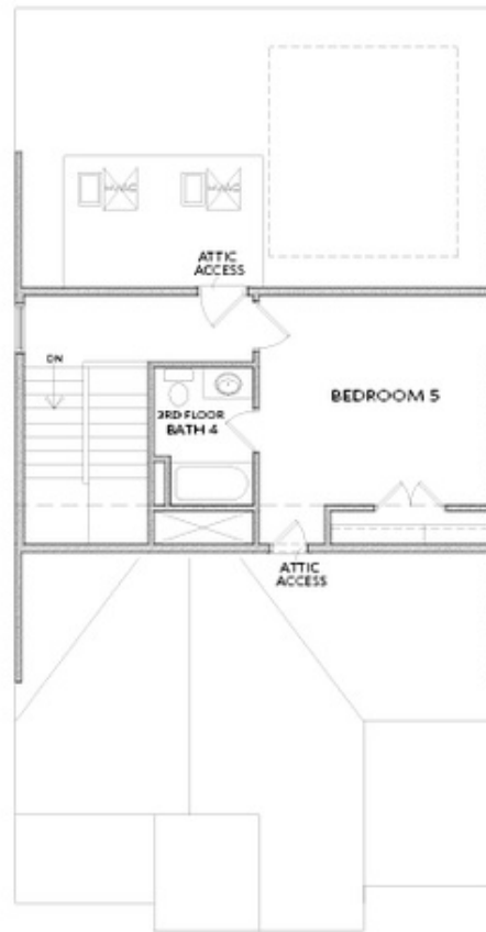
OPT THIRD FLOOR