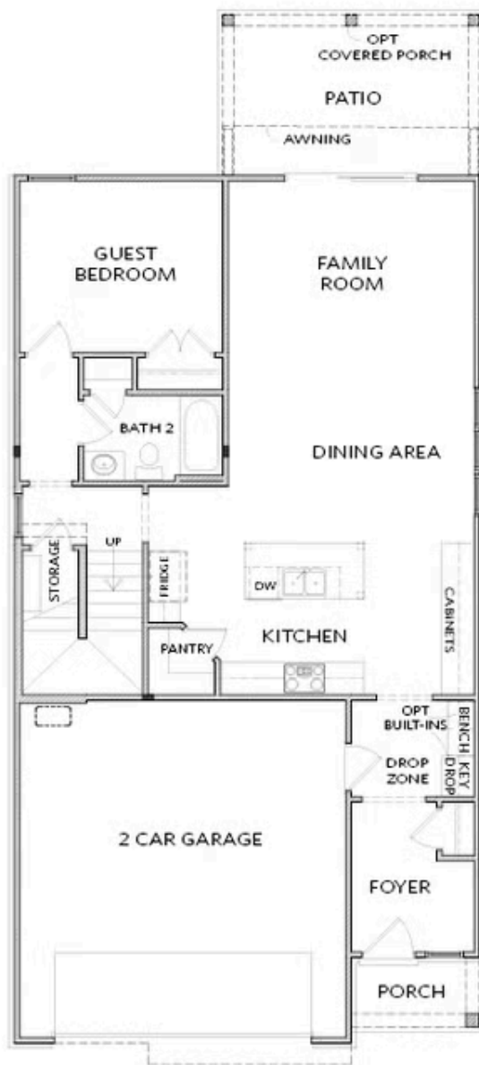
Elevation C & D