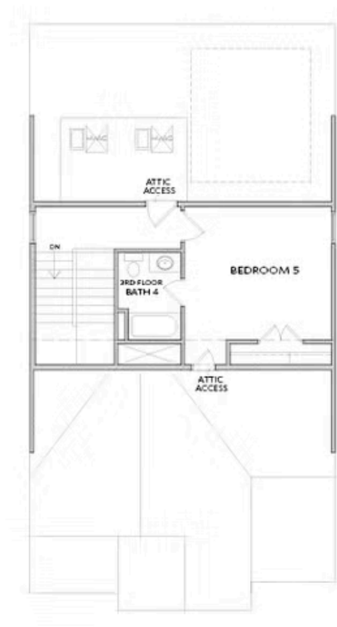
OPT THIRD FLOOR