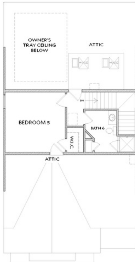
OPT THIRD FLOOR