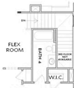
OPT Second Floor 3rd Bath When NO Third Floor is Slected