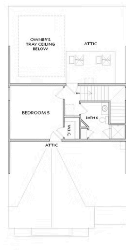
OPT THIRD FLOOR