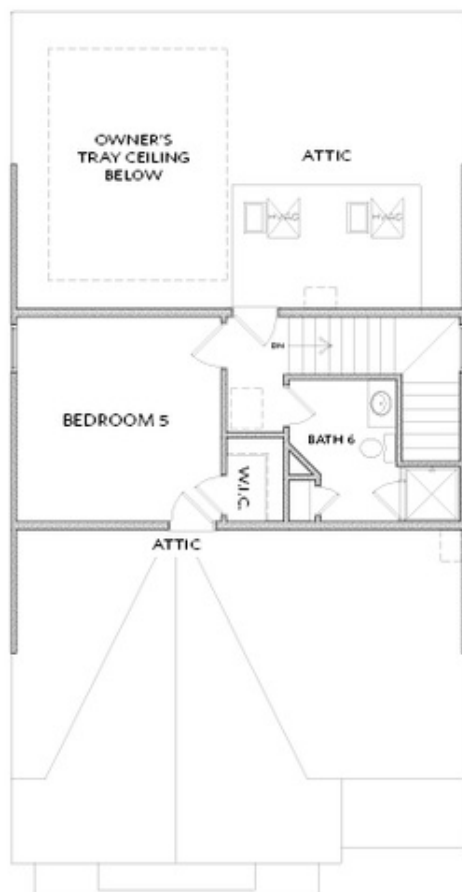
OPT THIRD FLOOR