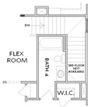
OPT Second Floor 3rd Bath When NO Third Floor is Selected