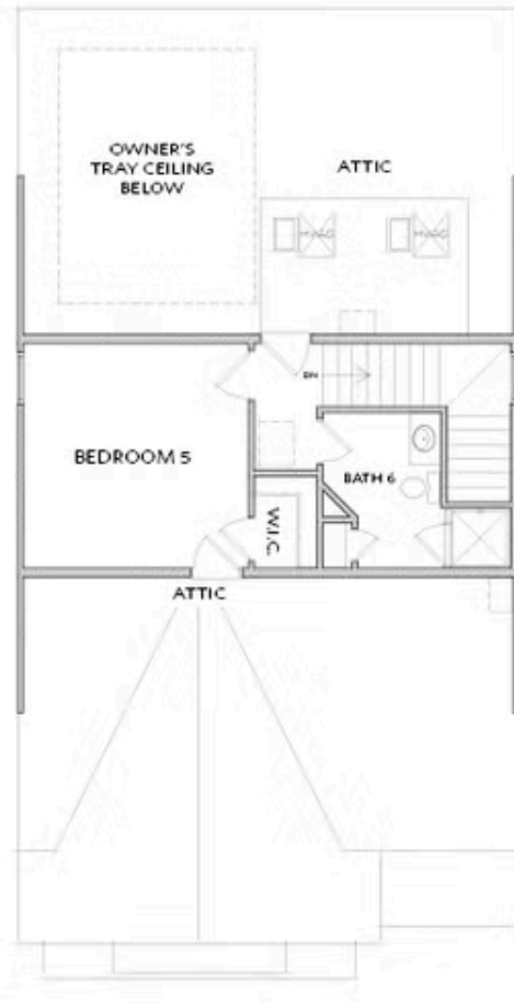
OPT THIRD FLOOR