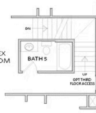
OPT Second Floor 3rd Bath When OPT Third Floor is Selected