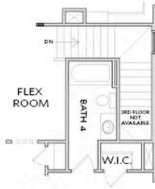
OPT Second Floor 3rd Bath When NO Third Floor is Slected