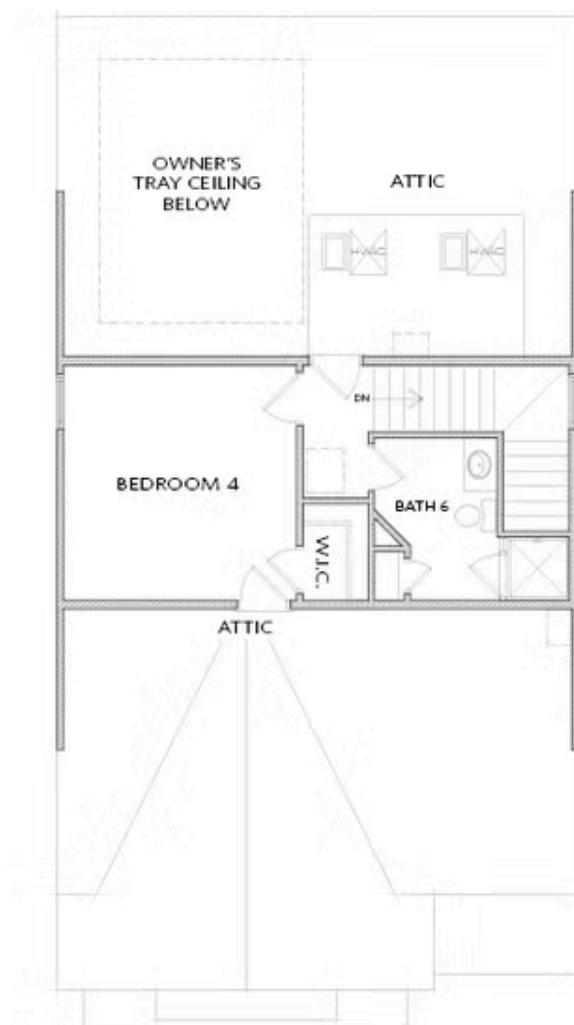
Elevation C & D