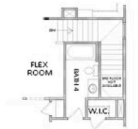
OPT Second Floor 3rd Bath When NO Third Floor is Selected