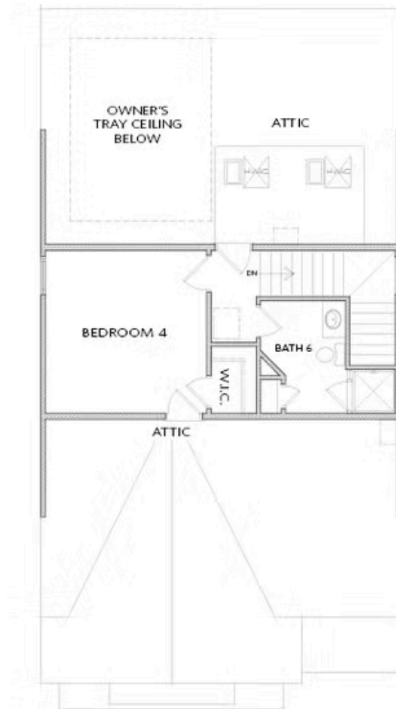
Elevation C & D