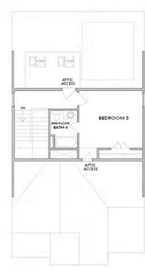
OPT THIRD FLOOR