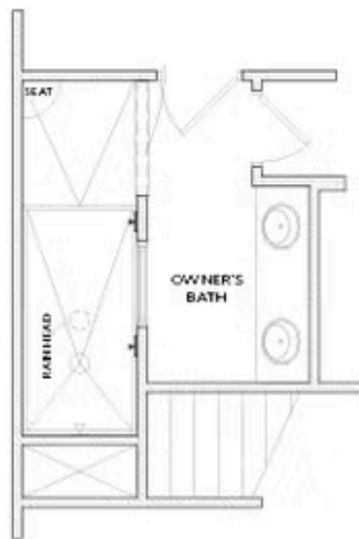
OPT Walk-In Shower