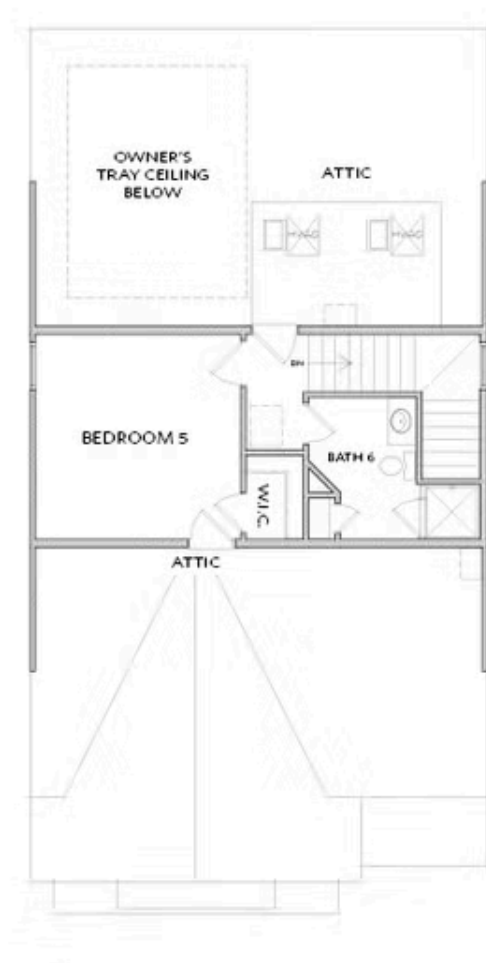
OPT THIRD FLOOR