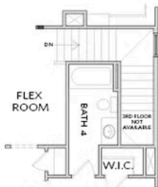
OPT Second Floor 3rd Bath When NO Third Floor is Slected