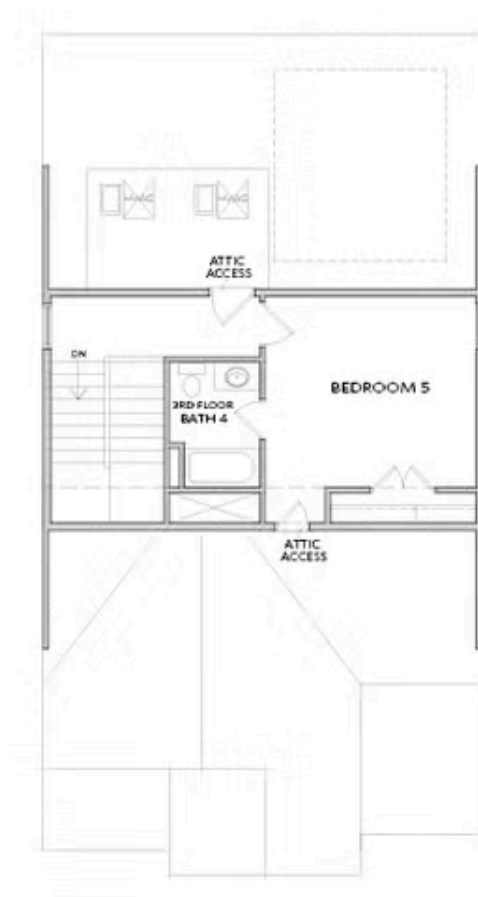
OPT THIRD FLOOR