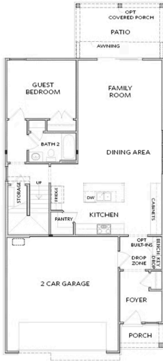
Elevation C & D