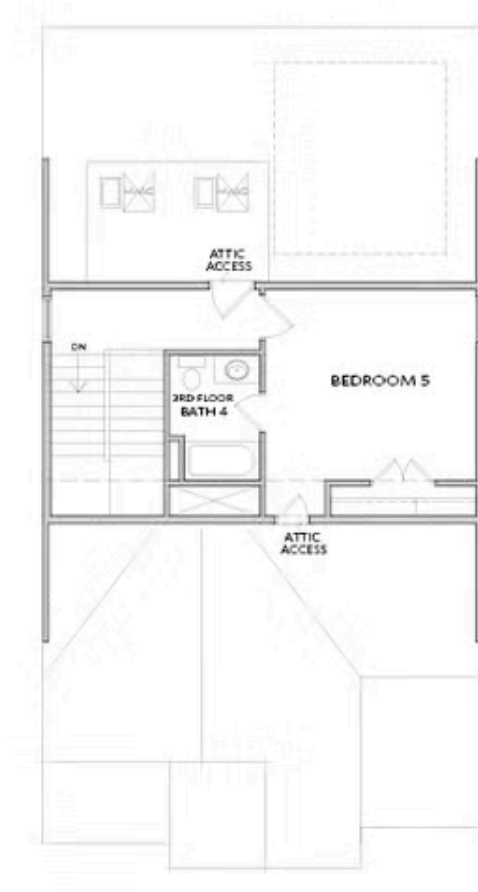
OPT THIRD FLOOR