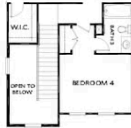
OPT Bedroom 4 & Bath 3 ilo Loft