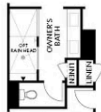
OPT Owner's Walk-Through Shower