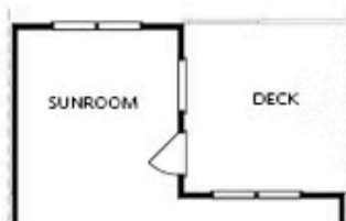
OPT Sunroom & Full Deck