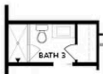
OPT Shower ilo Tub/Shower Combo