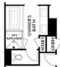
OPT Owner's Shower & Tub Combo