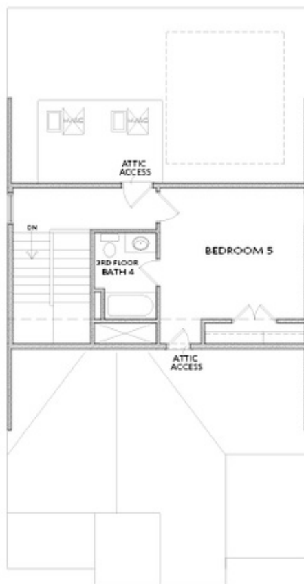
OPT THIRD FLOOR