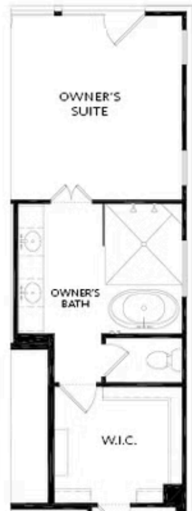
OPT Owner's Wet Bath