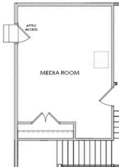
OPT Media Room ilo Loft