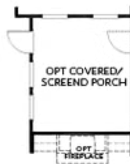
OPT Covered Porch/ OPT Screened Porch