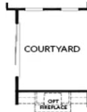
OPT Slider Door