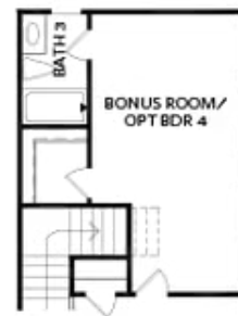
OPT Bedroom 4 w/ Bath 3 i/o Bonus Room