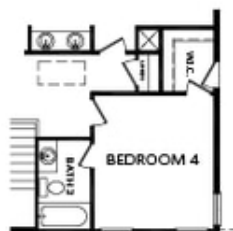
OPT Bedroom 4 w/ Full Bath 3