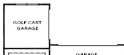
OPT Golf Cart Garage