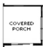
OPT Sliding Glass Door