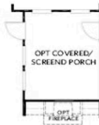
OPT Covered Porch/ OPT Screened Porch