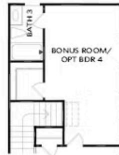
OPT Bedroom 4 w/ Bath 3 ilo Bonus Room