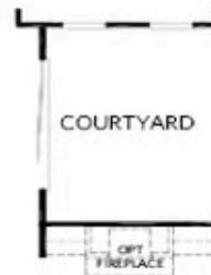
OPT Slider Door