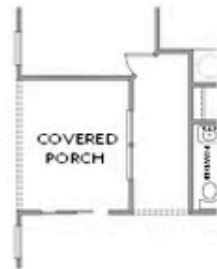
OPT Sliding Glass Door