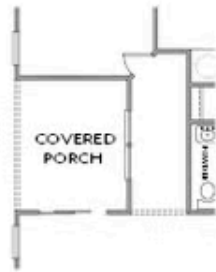
OPT Sliding Glass Door