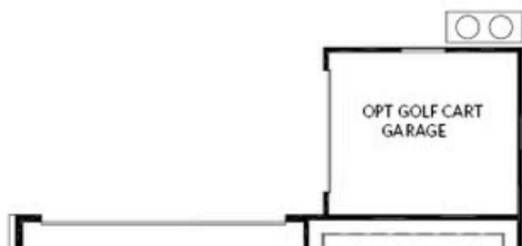
OPT Golf Cart Garage