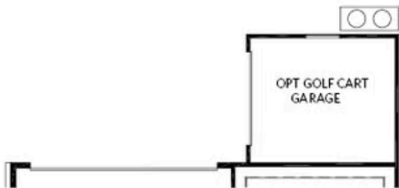
OPT Golf Cart Garage