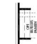
OPT Butler's Pantry