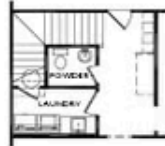
Stair Layout IF OPT Second Floor