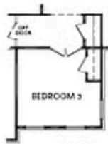
OPT Bedroom 3 into Office