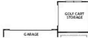
OPT Golf Cart Storage