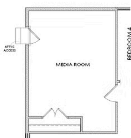
OPT Media Room ilo Flex Room