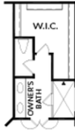
OPT Extended Owner's W.I.C w/ Large Shower Only