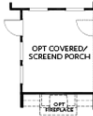
OPT Covered Porch/ OPT Screened Porch