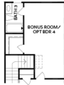
OPT Bedroom 4 w/ Bath 3 ilo Bonus Room