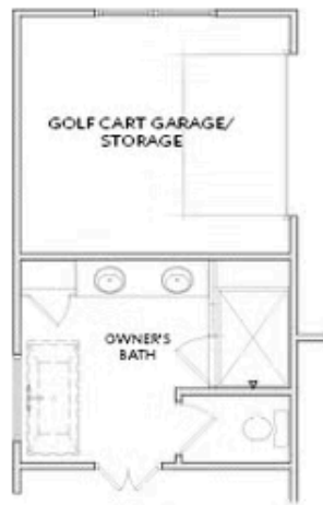
OPT Golf Cart Garage/Storage