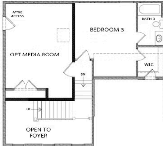
OPT Media Room ilo Flex Room