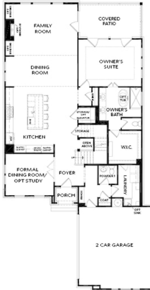
FIRST FLOOR - SLAB