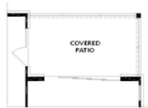
OPT Slider Door at Covered Patio