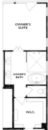
OPT Owner's Wet Bath