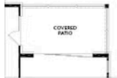
OPT Slider Door at Covered Deck