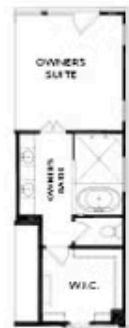
OPT Owner's Wet Bath