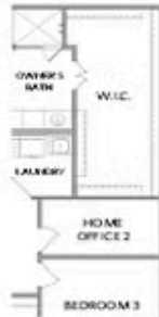
OPT Home Office 2 w. Larger W.I.C. & Larger Laundry into Bedroom 4