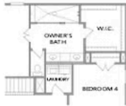
OPT Owner's Walk-In Shower