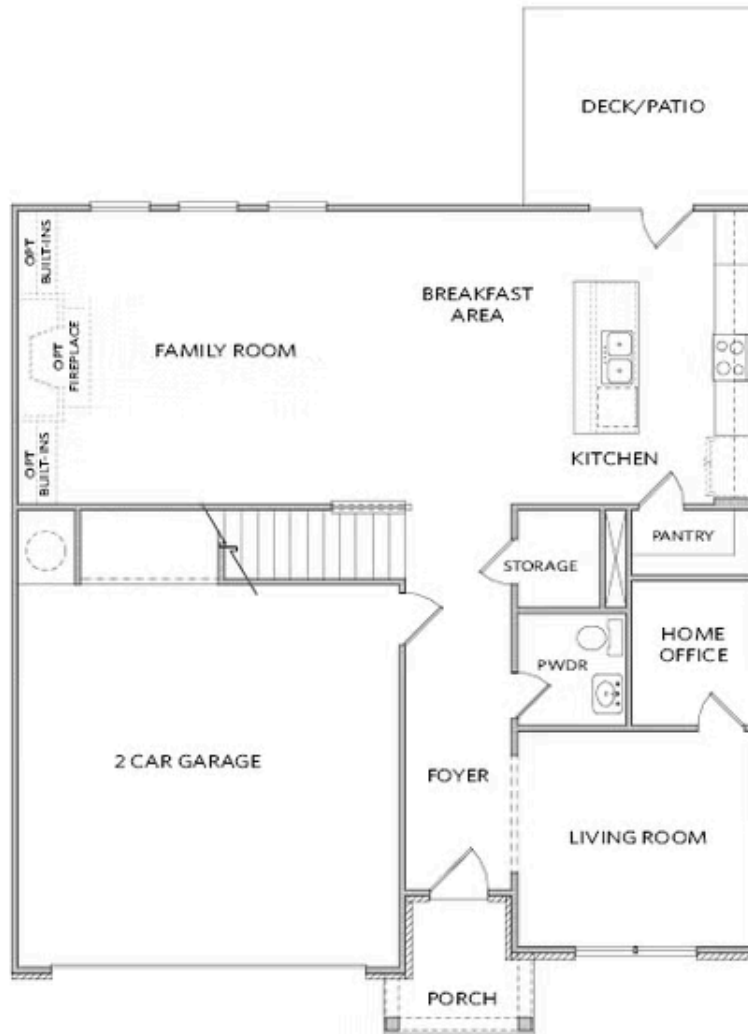
Elevations A & B