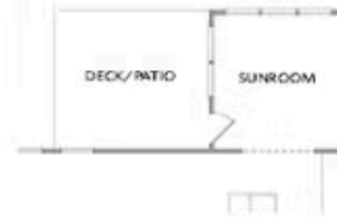
OPT Sunroom w. Deck/Patio