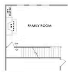
Layout When on a Basement