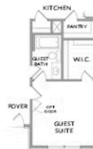
OPT Guest Suite w. Full Bath ilo Living RM, Powder RM & Home Office