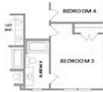
OPT Bath 3 at Bedroom 3 *ONLY Available on Elevation B