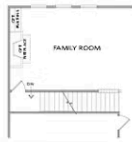
Layout When on a Basement