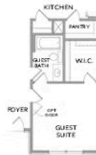
OPT Guest Suite w. Full Bath into Living RM, Powder RM & Home Office