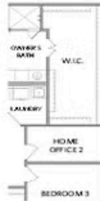
OPT Home Office 2 w. Larger W.I.C. & Larger Laundry ilo Bedroom 4