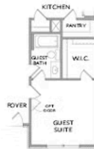
OPT Guest Suite w. Full Bath into Living RM, Powder RM & Home Office