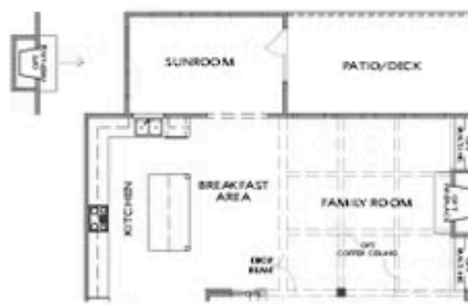
OPT Extended Kitchen w. OPT Sunroom & OPT Patio/Deck