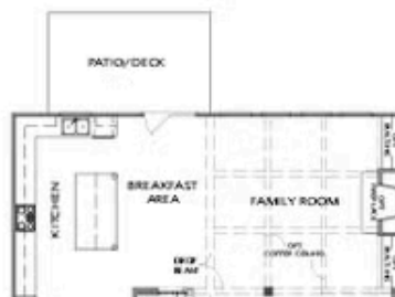
OPT Extended Kitchen