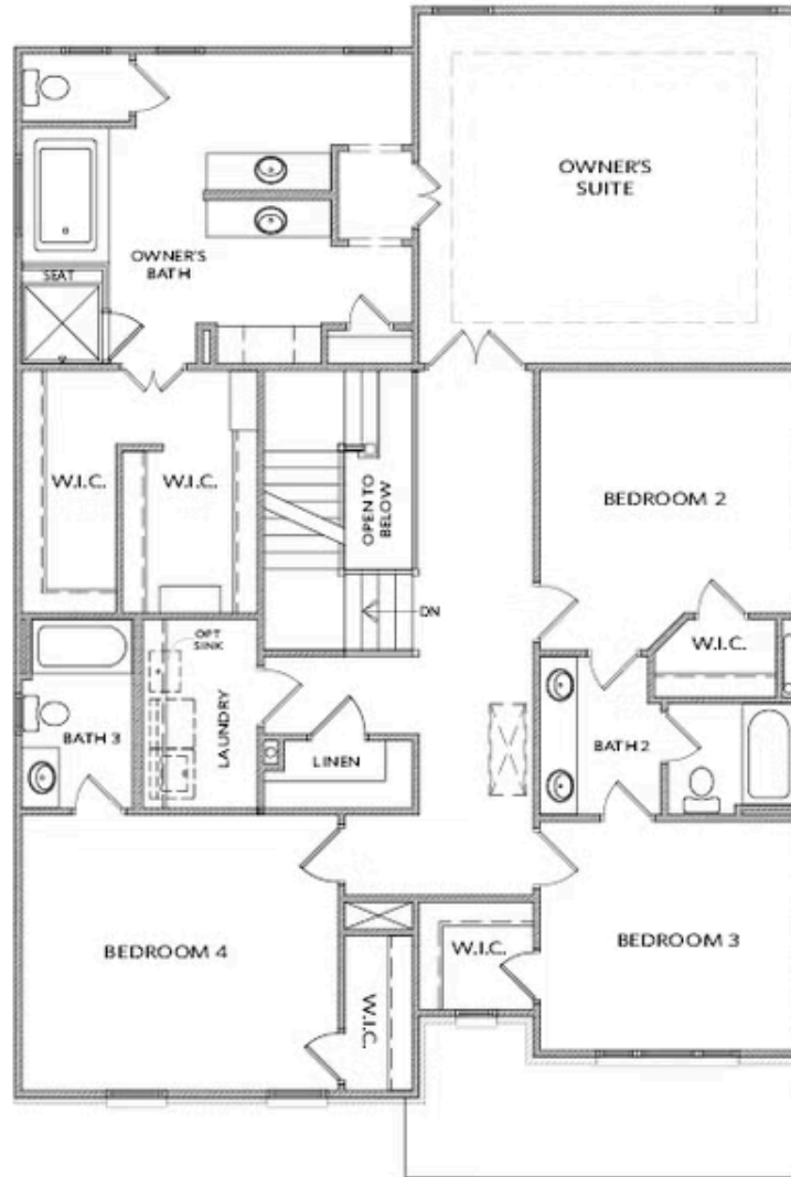
Elevation A & B