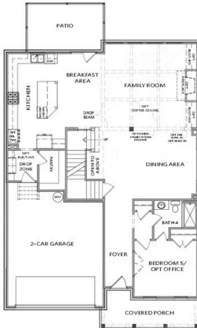
Elevation A & B