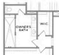
OPT Owner's Walk-In Shower