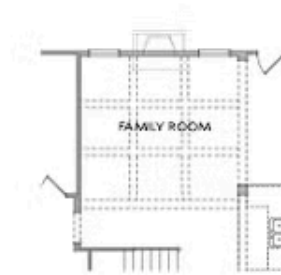
OPT Coffered Ceilings With OPT Media Room -or- Bedroom 5 Above