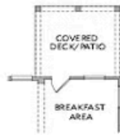
OPT Covered Deck/Patio