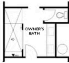
OPT Walk-In Shower